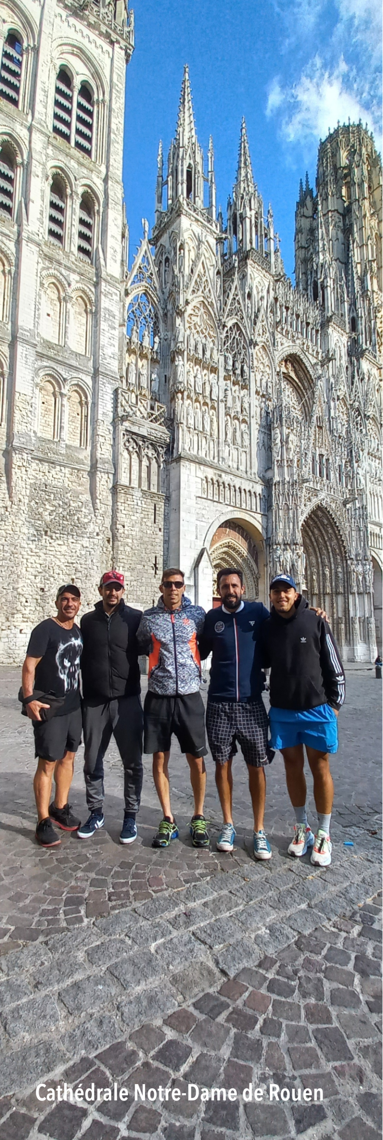
Cathédrale Notre-Dame de Rouen